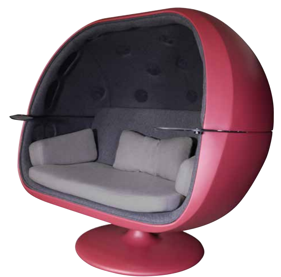
22.2ch Audio Chair SA-1852